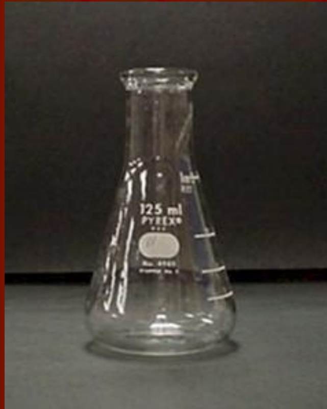
● Erlenmeyer Flask